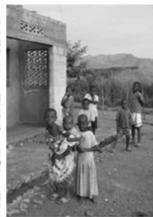
One of our school construction sites here in South Kivu